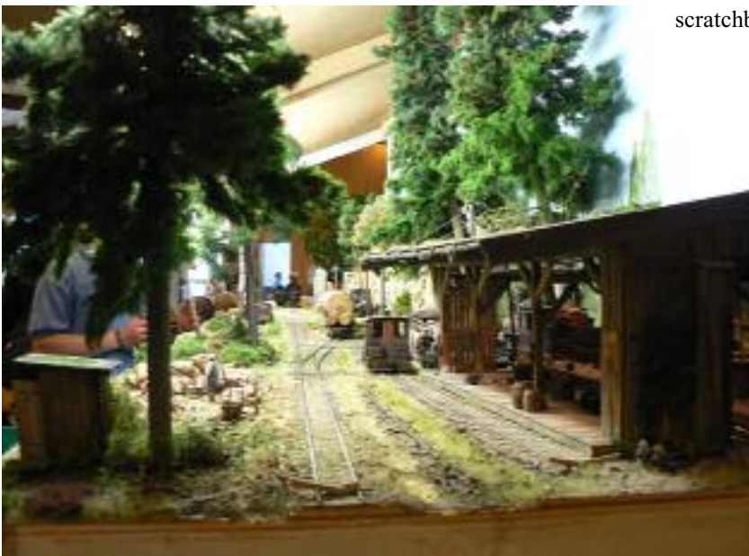
Operating O-scale logging diorama. A small fiddle yard is connected to the far end of the diorama. (top)