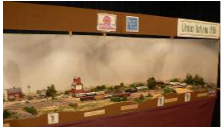
Operating N-scale model of a midwest town. The track connects to a staging yard behind the scene. (top)